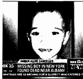
Amber Alert canceled after child's body found