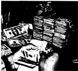
The Most Brilliant Way To Pay Off Your Mortgage