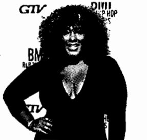
Model And Former American Idol Beauty Dead At 32