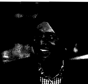
Ex-Microsoft Exec Looks to Turn Wall Street On Its Head