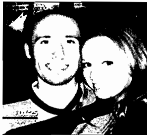
Man sentenced to 6 months in jail for hitting, killing couple i...