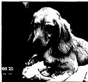
Hospital caring for 70 dogs rescued from Westminster...